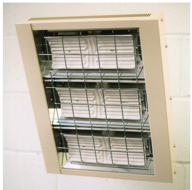
Model No – HLC45 220-240v 4500W Or 380-415v 4500W