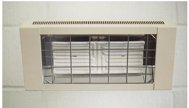
Model No – HLC15 220-240v 1500W