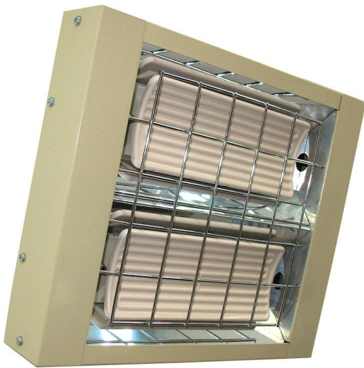
Model No – HLC30 220-240v 3000W

The Ceramic elements emit a high proportion of medium wave Infrared heat, this output is far less intense than the short wave version, and it can therefore be used where low level or space restricted instant heat is required. Ceramic elements produce no visible light, so can also be installed in situations where the red glow from short wave system would make them unacceptable, such as photographic studios, or where colour comparisons are used. To help make the right choice, remember Short Wave produces high output instant infrared heat (burning at around 2000°C) making them ideal for general zone/space heating in commercial and industrial areas of all types and sizes. Medium wave (burning at around 700°C) takes a few minutes to reach peak heat and are more suited to smaller areas, for example, shops, veterinary surgeries, studios, security offices, sheds etc.